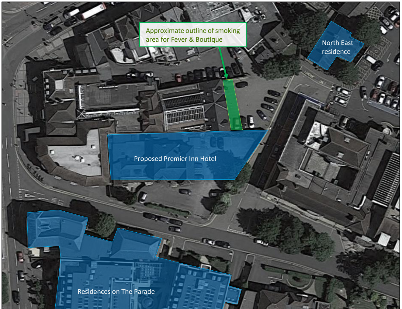
Satellite image provided by Google

4.1.1 A number of neighbouring residential properties have been identified, along with the approximate outline of a new Premier Inn hotel. These are shown in Figure 4.1.