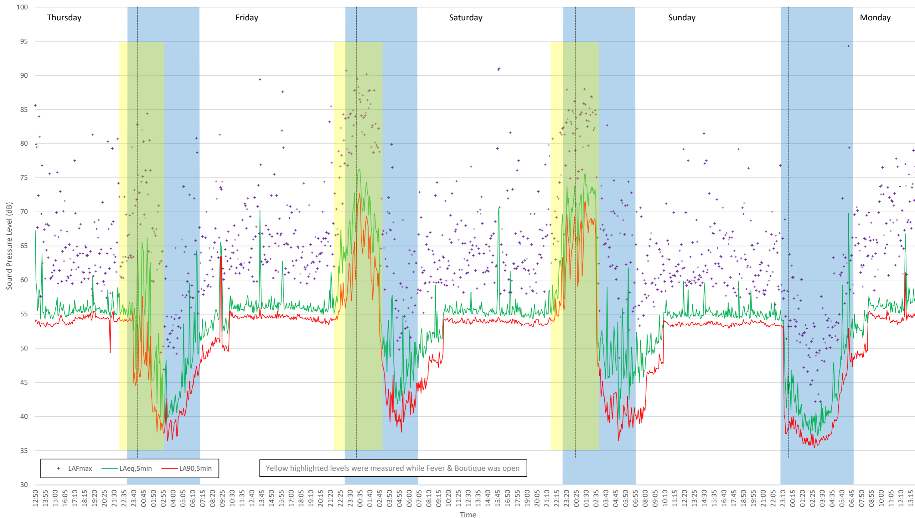
Figure 3.2 Level history graph for measurements 05/01/2017 – 09/01/2017

3.3.1 A selection of the measurement results is presented in Appendix A, and the full data is available in electronic form on request. A graph showing the level-history for the measurements is given in Figure 3.2.